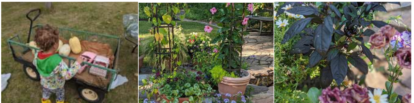
Snapshots of our garden walk: the natural connection between squash and cars (according to a toddler), a backyard pathway and brown-toned Lisianthus.

Garden Walks were our newest event addition. They were a direct response to COVID-19 protocols. Members were invited to walk through five gardens throughout two days. Walkers were privy to two valuable lessons from each garden host: two things you would definitely do again and two things you would never do again. We will continue this event as many really appreciated it. A branch of the garden tours is the creation of short garden videos built on one garden theme or technique. These videos share knowledge, showcases creativity and enhances our social media presence.